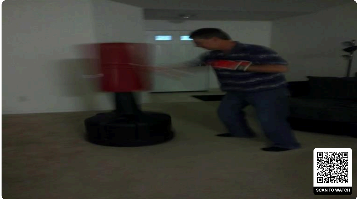
My beloved dad. Love you forever